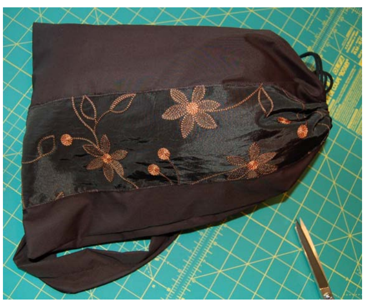
Now you have a stylin' Mei Tai!